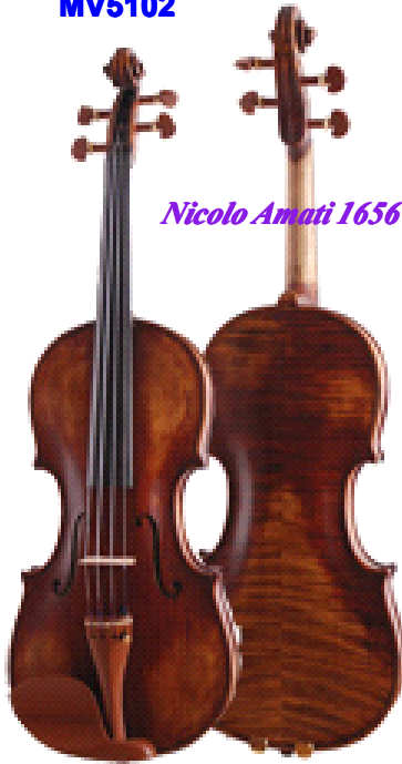
Nicolo Amati 1656